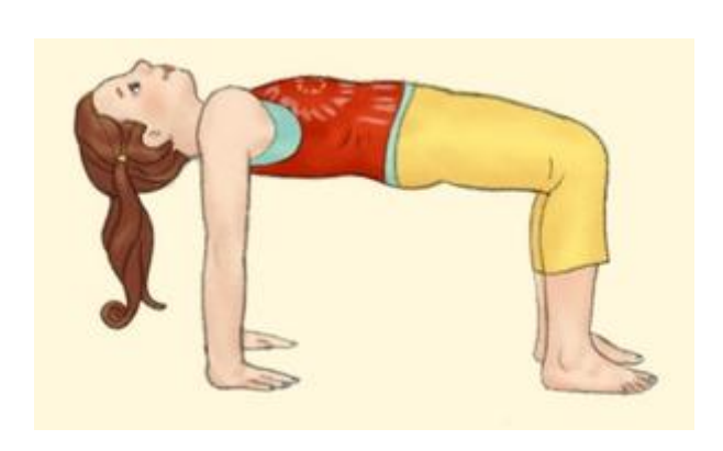
Warm up challenge make a shell