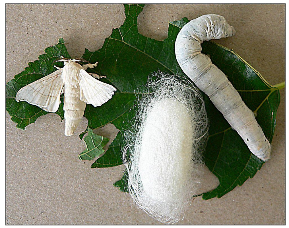
The Silk Worm

The Globe Skimmer is a species programmed from birth to migrate. This Dragon Fly lays eggs on its migration before it dies and its off-spring continues the journey. The exact same species is found on every continent which means they can fly across oceans.