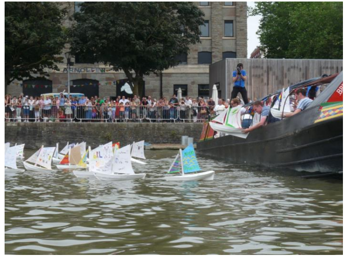
Launching the 'prettiest' boat first at the children's race

Bath and Bristol IMechE Young Members Panel