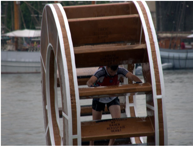
2014 winner of 'Most Spectacular Boat'